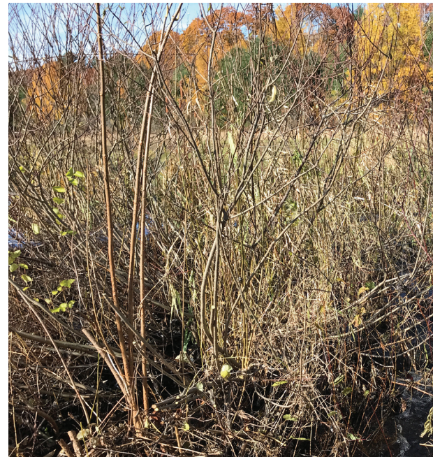
Access over the stream at the Moreau Donation was nearly impassable (above). Rick's long day of brush removal provides seasonally wet, but useable, access across the old Benson Rd. Be aware that the road is washed out in one area creating problems at times. See Rick's letter at right, p3.....